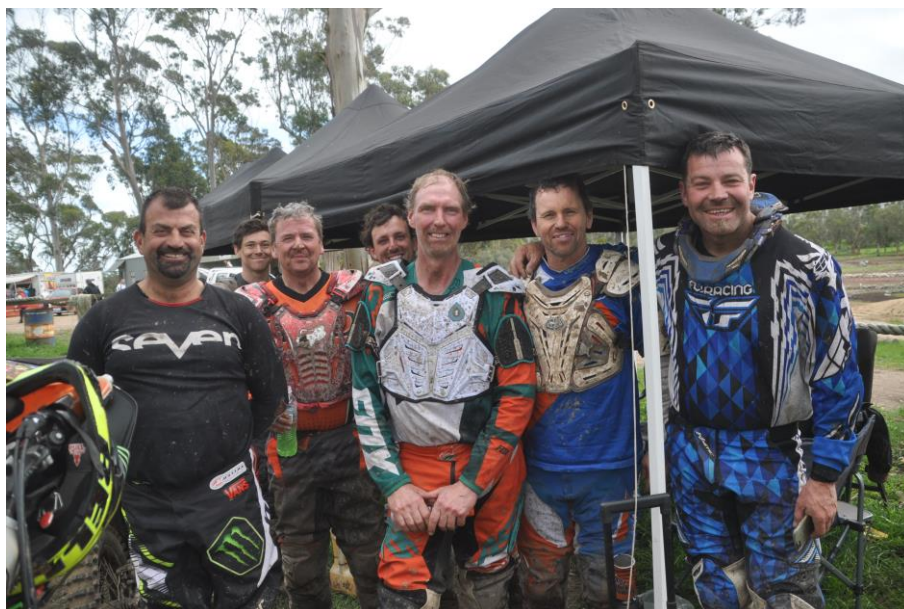
Miss racing with these old-farts Masters

If you are receiving this email from a mate and want to get it straight from us – send us an email!