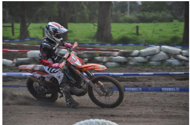
Wins today, and the series outright