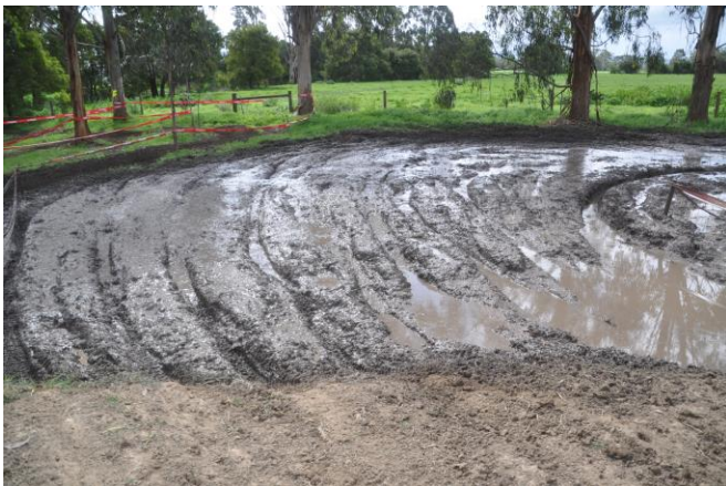
Le Bog – choose your line