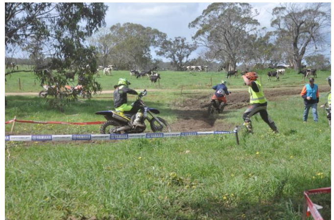
Cheering on mates as the cows ignore us all