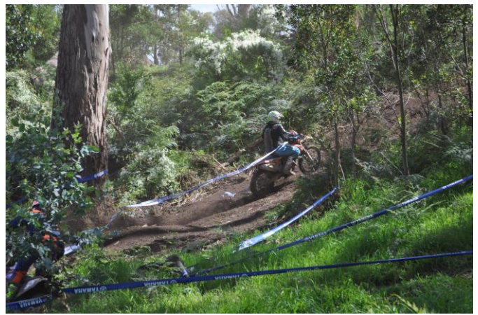
Peter Leigh #542 decides 12kms of bunting is too much