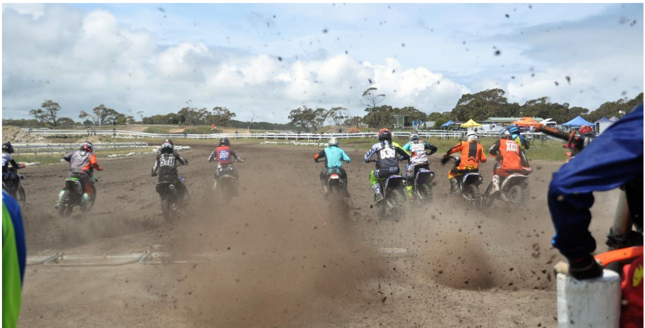
Open class head out in round 2