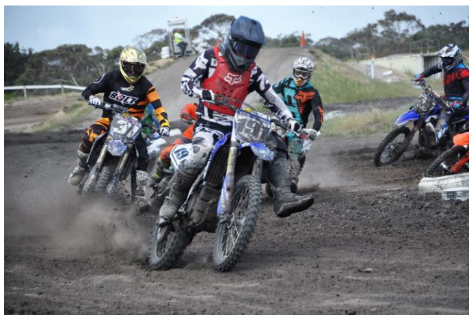
Open, race 3 Gelly holeshot