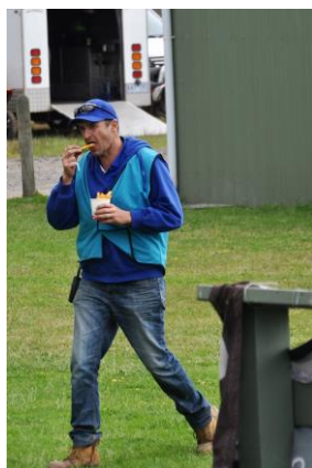
Cappa – hot chips and gravy mmmmm