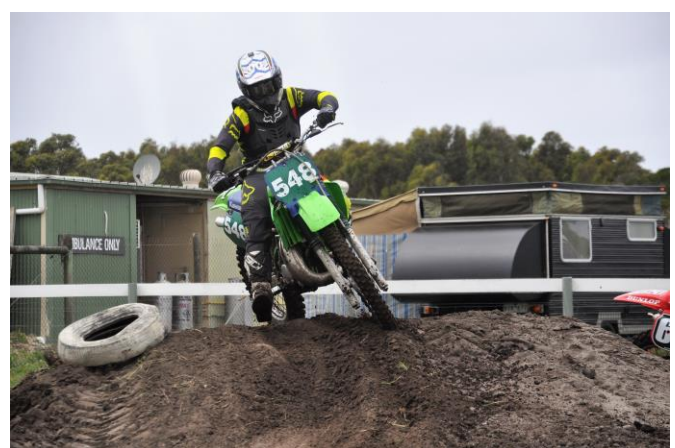
and Pre90 on his Kwaka