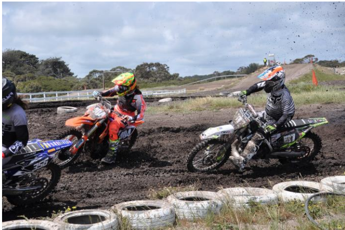
Holeshot corner, Senior Lites