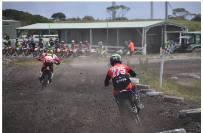
Acland Rush #275, third in B Lites