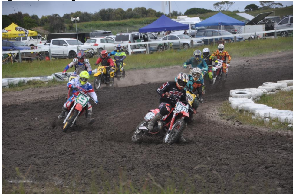
Pre90 race 1 – Cooper holeshot

With the 2016 Viper series over, the Viper VMX boys were looking for a ride and after riding quite a few natural terrain and grass track events this year they got a chance to put their motocross bikes on a motocross track. And they really enjoyed it and hopefully will bring a round of the Viper series to Wonthaggi in 2017, like they used to have on the calendar. I actually used to ride these events. Thanks guys for supporting this class. A grid of ten vintage bikes made for great spectating: