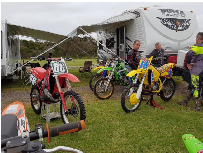
Viper boys were in town

Anyway Jo set off bright and early Saturday morning to Wonthaggi where it was overcast, cold and drizzly. Then sunny. Then drizzly. Definitely a case of four seasons in one day.